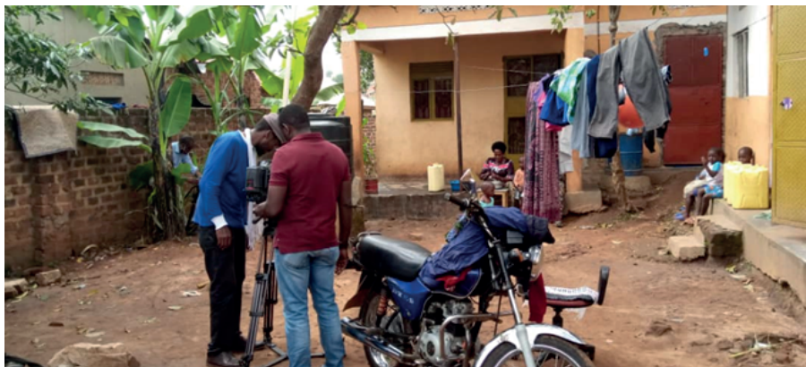
Photo of home interview of a women living with HIV and hypertension as part of filming by TASO.

TASO, who is leading on community engagement activities in Uganda, continues to work on a short film showing patient perspectives on living with chronic conditions and being part of a research study. Following delays due to COVID-19, filming has now started and we expect to have a draft film in October.