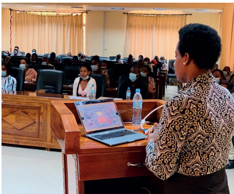
INTE-AFRICA training session, Dar es Salaam, Tanzania

We have drafted the protocol and have circulated for comments. We would like to expediate ethics clearance.