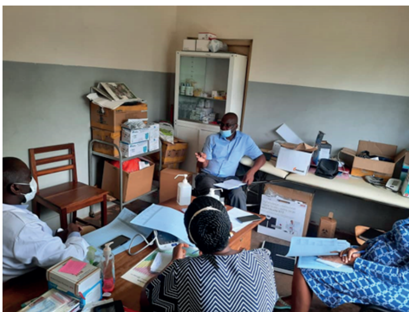
Photo of a meeting of NCD and HIV In-Charges at Mpigi Health Centre, Uganda

Integrated clinics started in Uganda in late July and in Tanzania in mid-August.